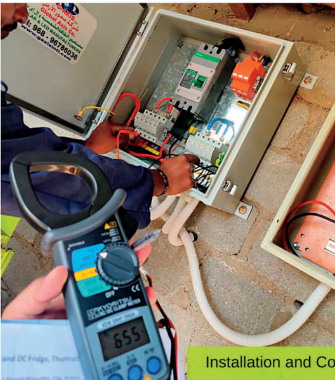
Installation and Control