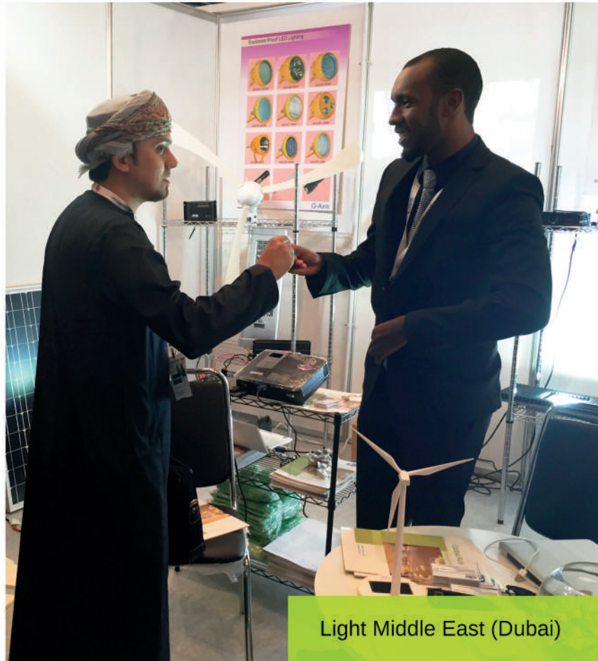
Light Middle East (Dubai)