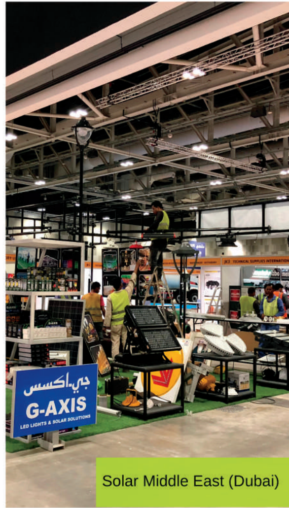
Solar Middle East (Dubai)