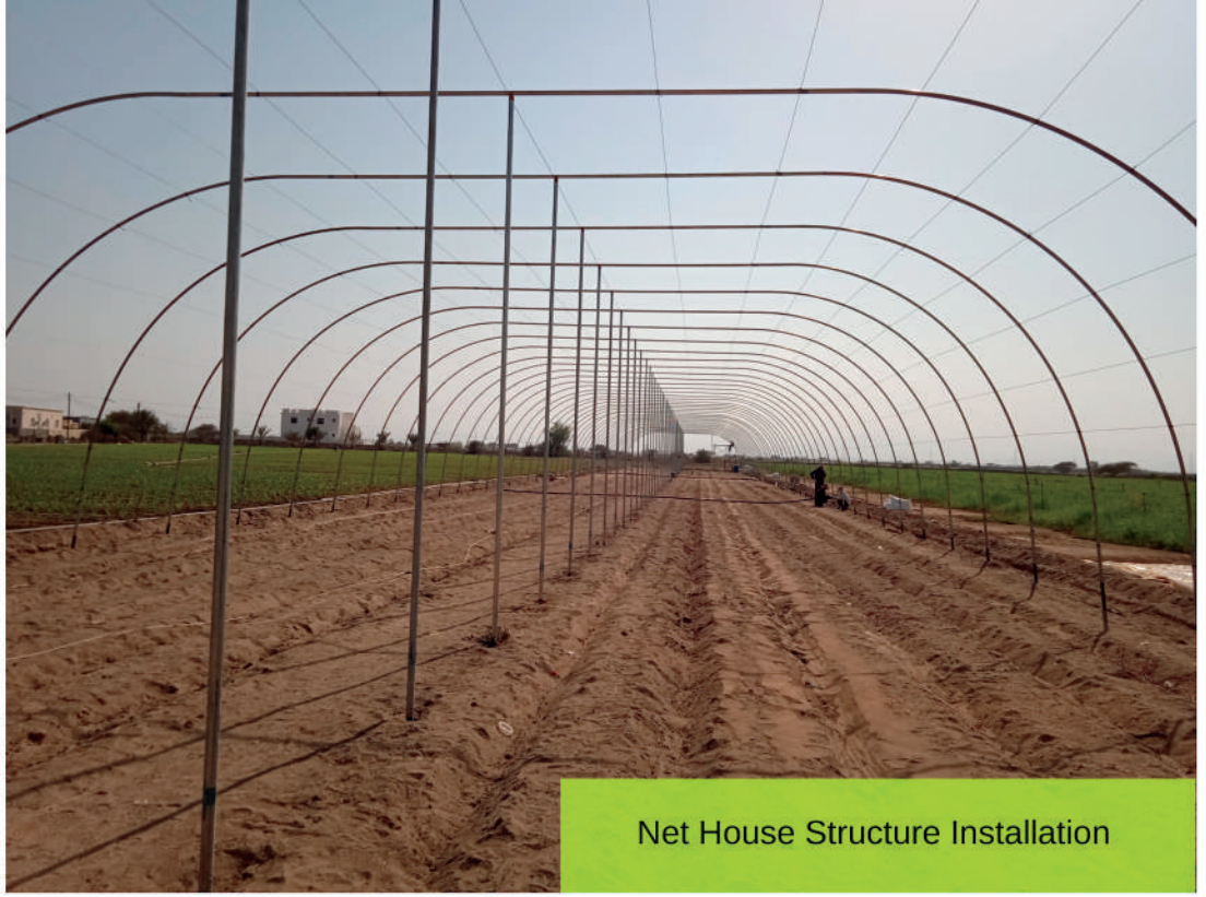
Net House Structure Installation