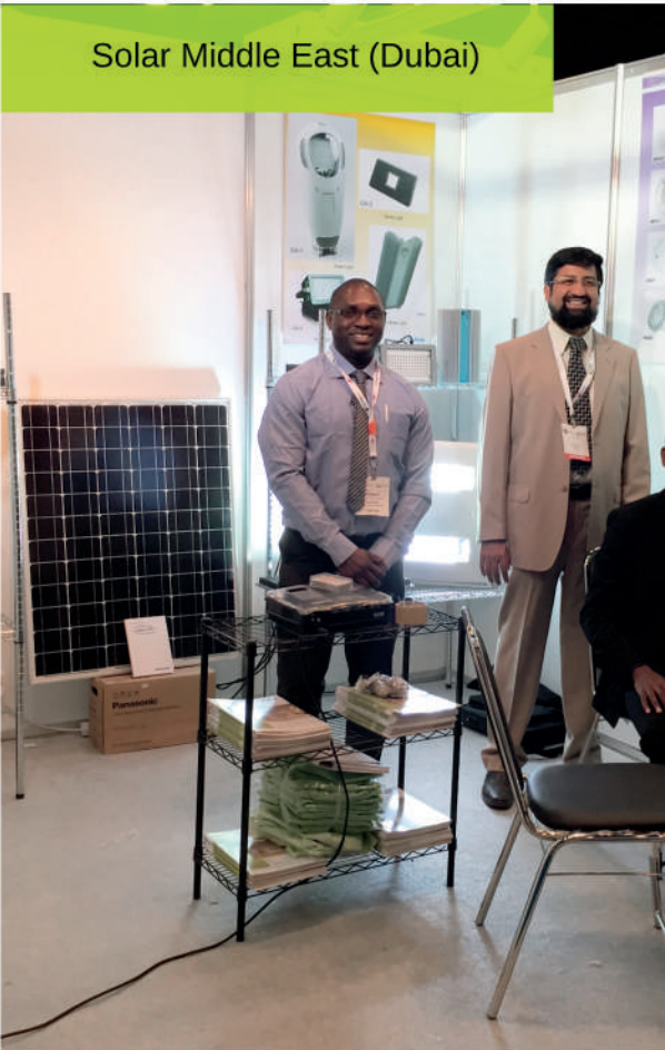
Solar Middle East (Dubai)