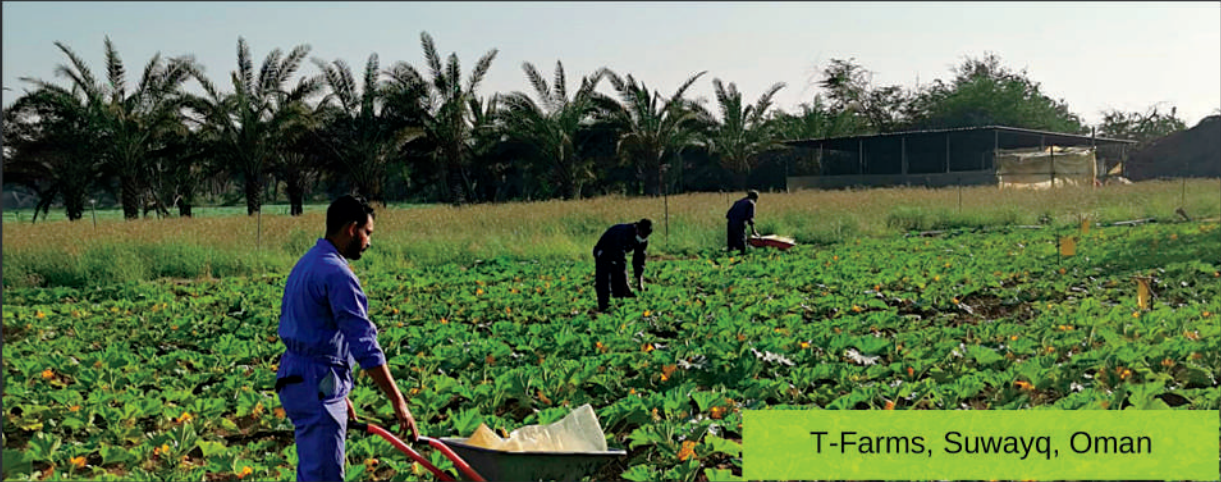
T-Farms, Suwayq, Oman