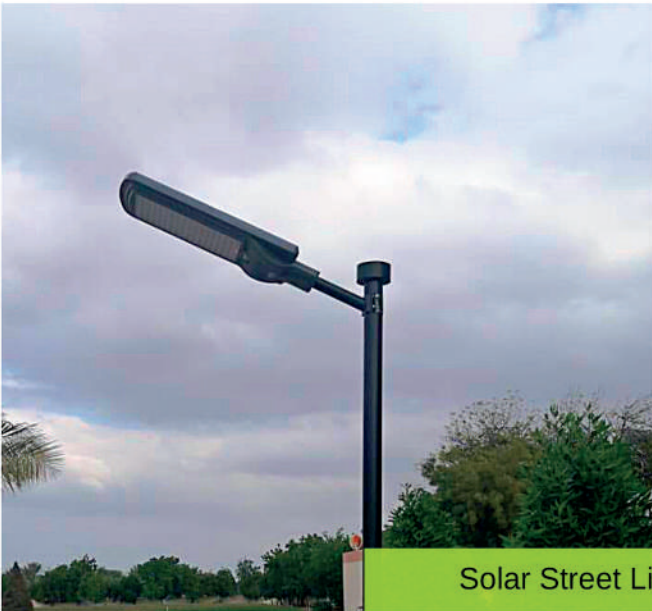
Solar Street Light