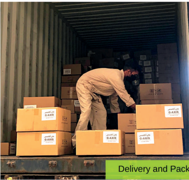
Delivery and Packaging