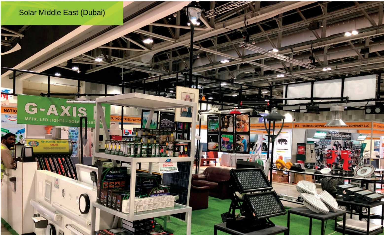
Solar Middle East (Dubai)